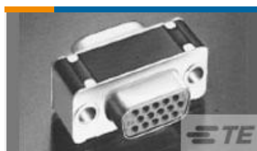
TE Part # 211012-4 AMPLIMITE CONN SVR,44 POS,TRW