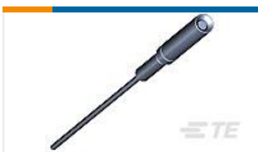
TE Part # 207684-4 AMPLIMITE,SKT CONT,SZ 22