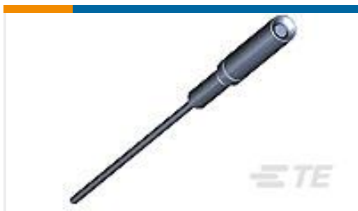
TE Part # 207684-3 AMPLIMITE,SKT CONT,SZ 22