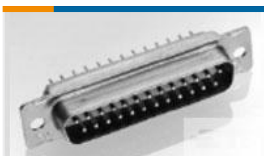
TE Part # 1757824-8 AMPLIMITE,ASY,RCPT,STD,90,ZN,2, CONT