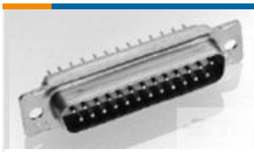
TE Part # 1-1757824-2 AMPLIMITE,ASY,RCPT,STD,90,ZN,6, CONT