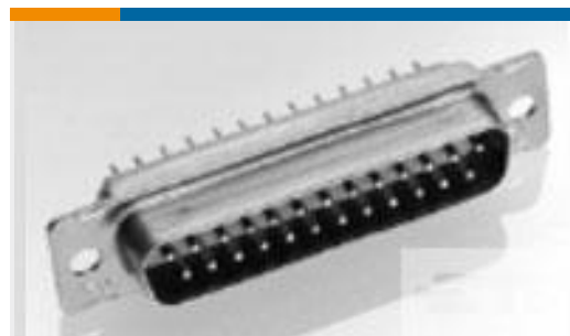
TE Part # 1-1757824-0 AMPLIMITE,ASY,RCPT,STD,90,ZN,4,CT