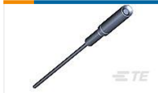
TE Part # 207684-1 AMPLIMITE,SKT CONT,SZ 22