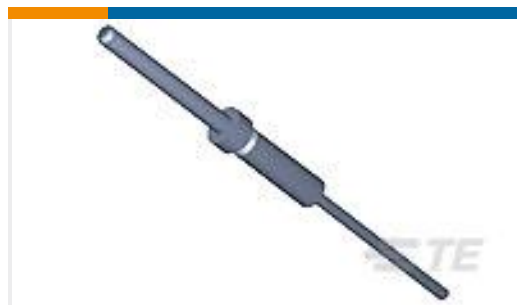
TE Part # 207683-2 AMPLIMITE,PIN CONT,SZ 22